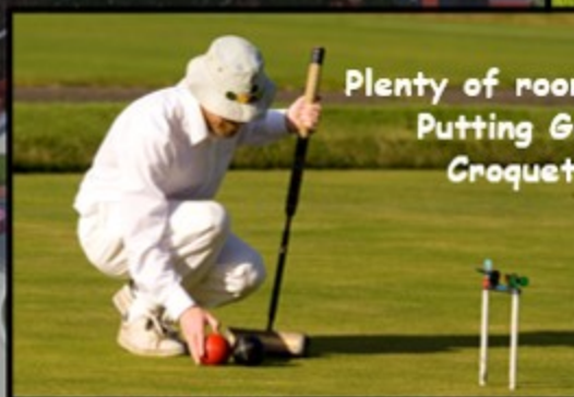
Plenty of room for multiple Putting Greens and Croquet Courts!