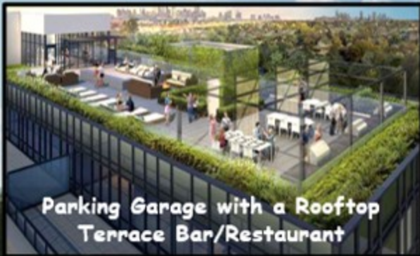
Parking Garage with a Rooftop Terrace Bar/Restaurant